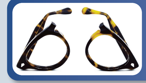
Shell Weld Repair (bridges, eyewires, trims & temples)