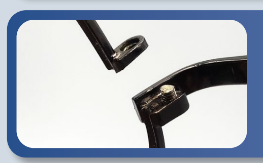
Drill Out Screw (any screw – anywhere!)