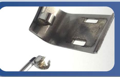
Closing Block / Rimlock Repair